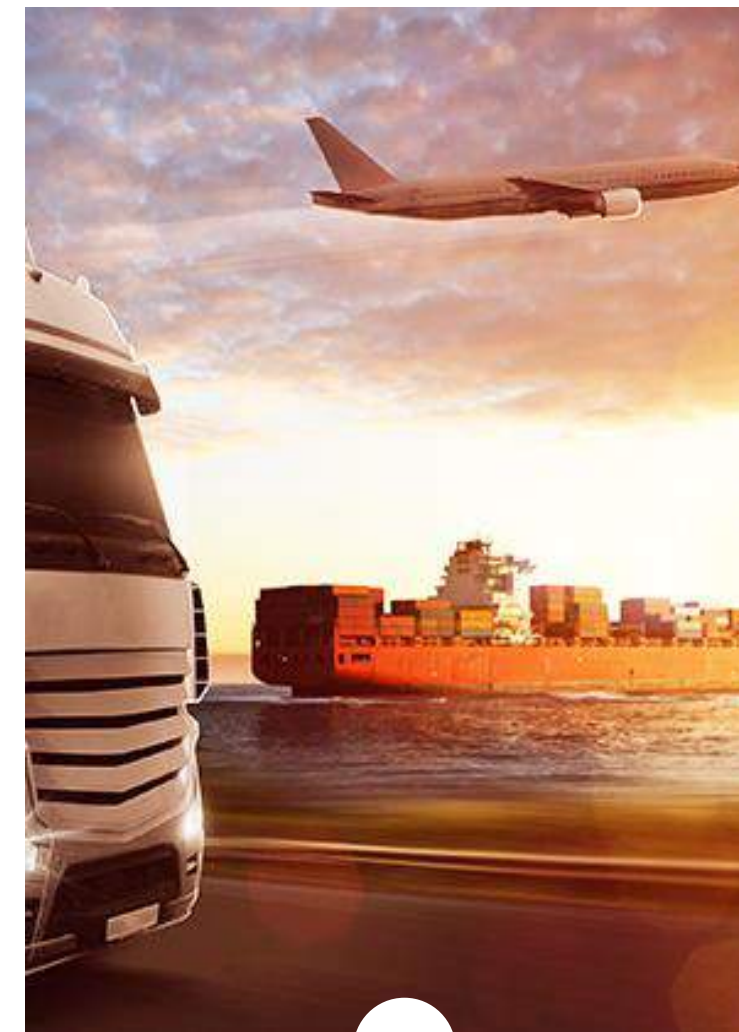
TRANSPORT & LOGISTICS