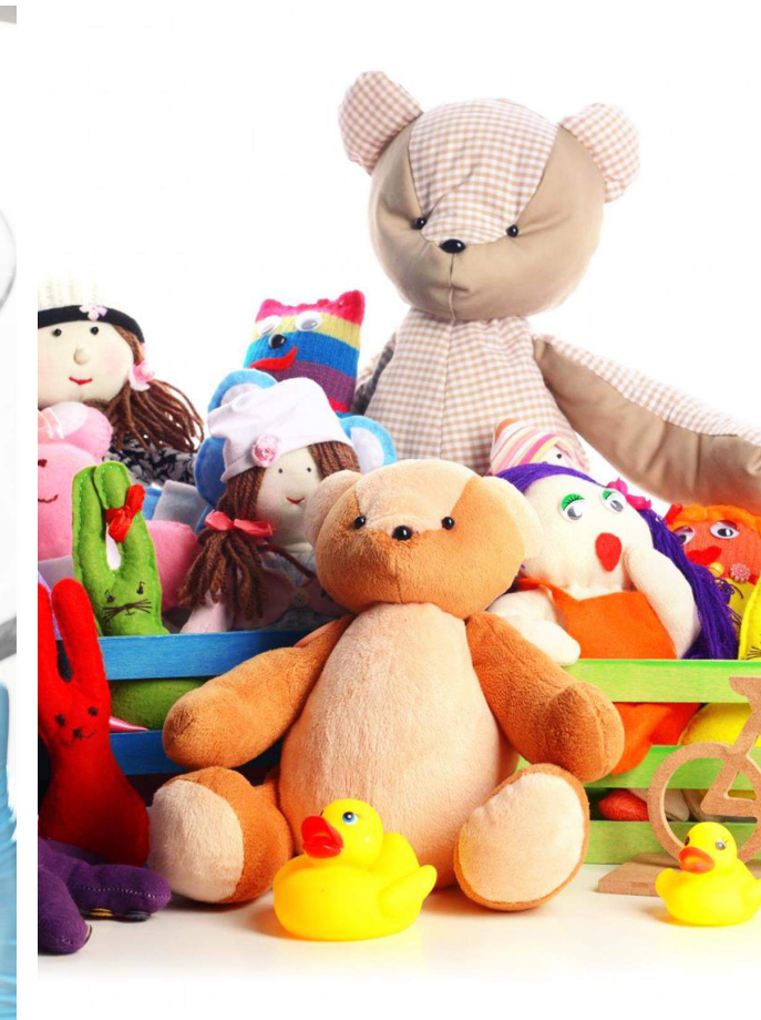
CE PRODUCT CERTIFICATION