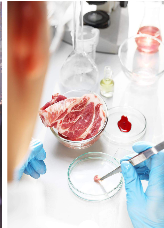
INSPECTION & SAMPLING