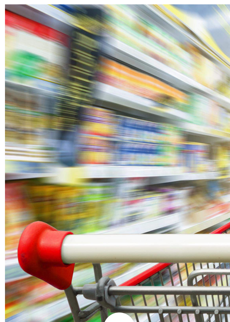
CONSUMER GOODS & RETAIL