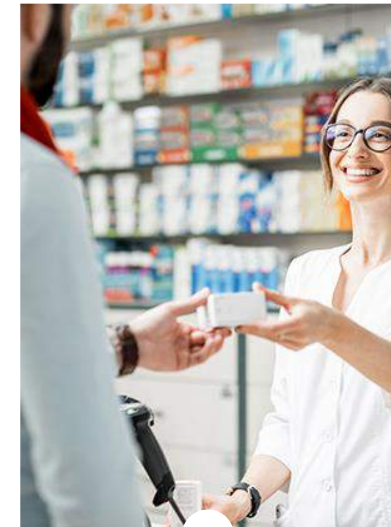
PHARMACEUTICAL & MEDICAL DEVICES